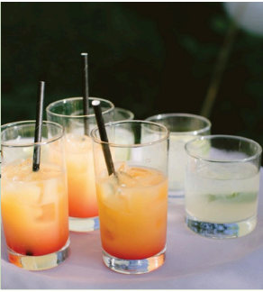
Colleen MacMillan Photography