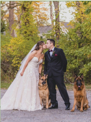
Yours Truly Media