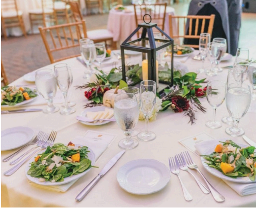
Yours Truly Media