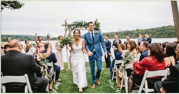
Aaron & Whitney Photography